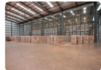
14.1m high bay